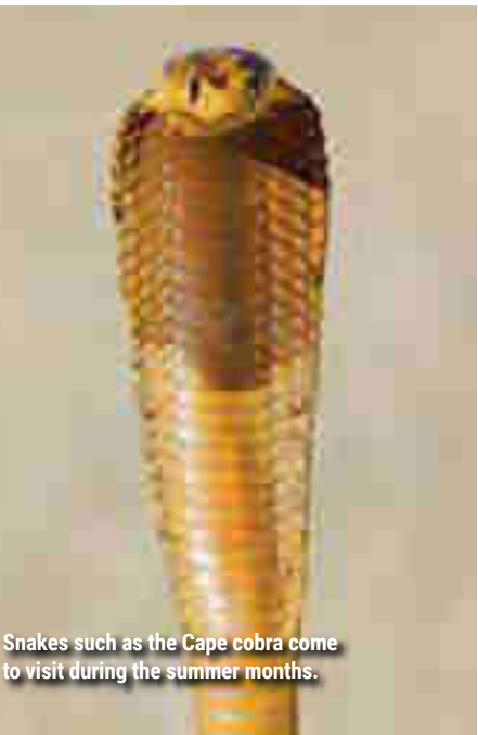
Snakes such as the Cape cobra come to visit during the summer months.