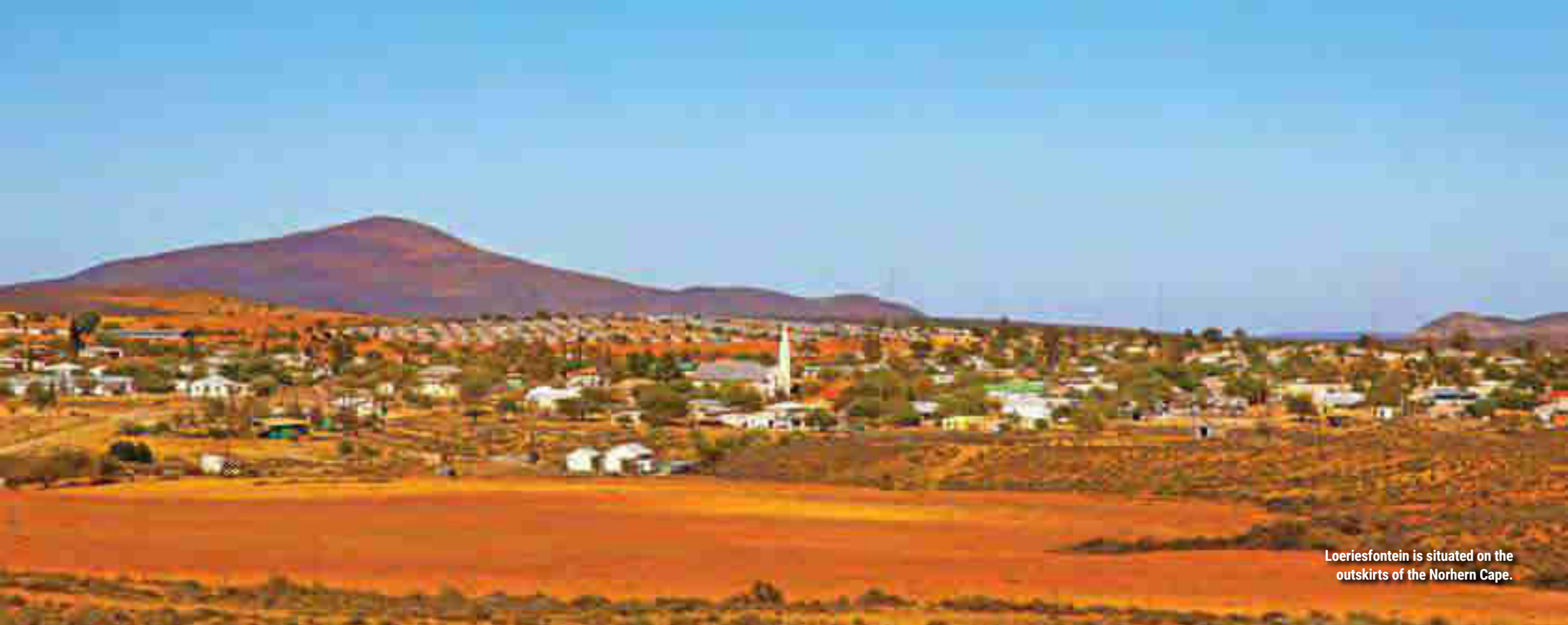
Loeriesfontein is situated on the outskirts of the Northern Cape.