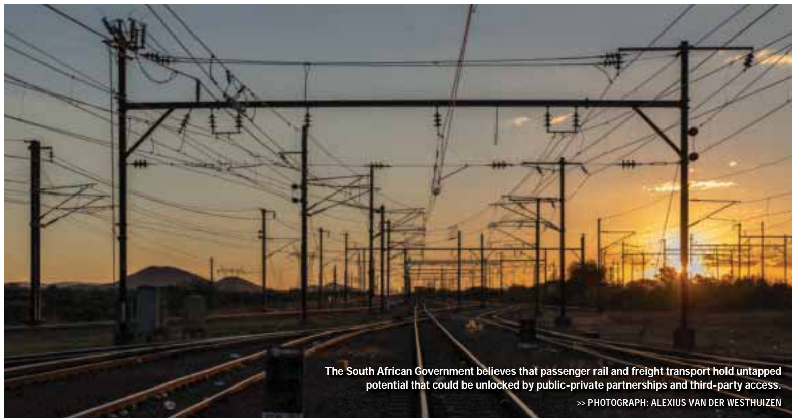
The South African Government believes that passenger rail and freight transport hold untapped potential that could be unlocked by public-private partnerships and third-party access.

"When President Cyril Ramaphosa announced that Government will establish the TNPA as an independent